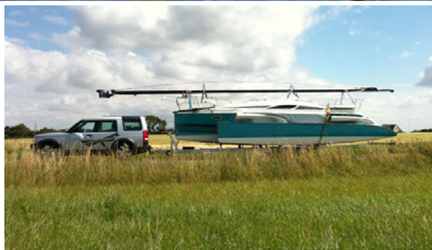
Use the boat as your camper while travelling.