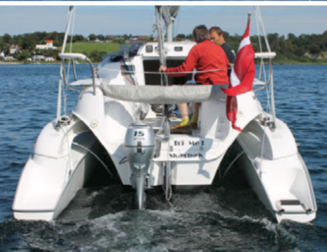
Easy to maneuver and high stability even folded.