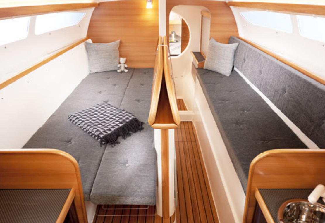
Main cabin converts in seconds for sleeping.