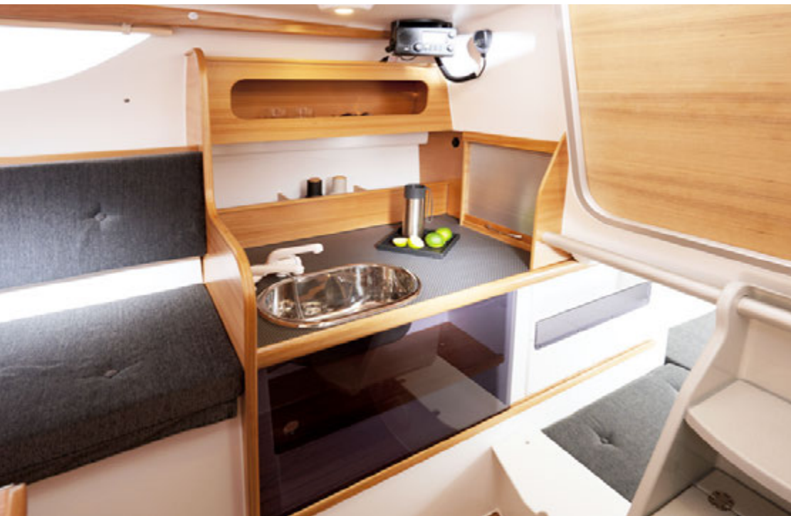
Starboard side galley.