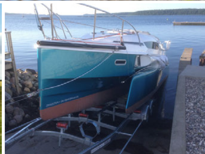
Launching without submerging the trailer.